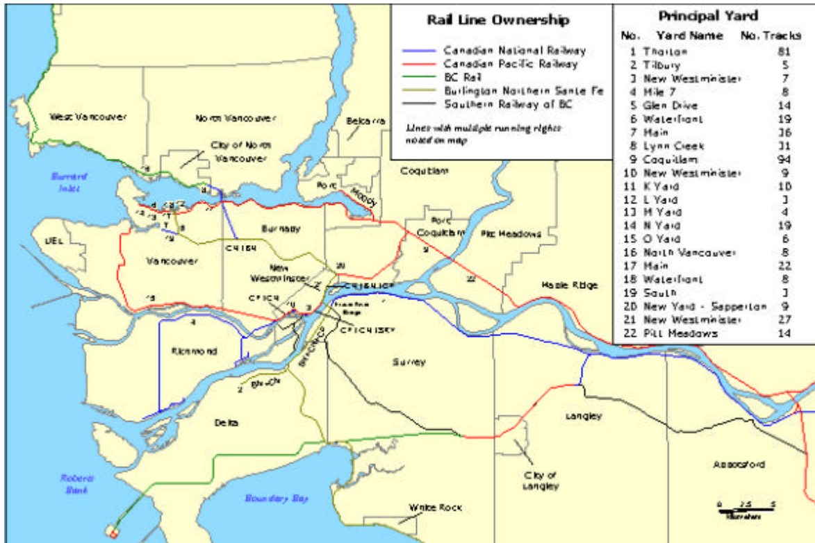
This map from Transport Canada's Freight Transportation In British Columbia: Final Report TP 13909 E , March 2002